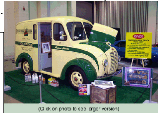
(Click on photo to see larger version)

If you missed it at the Rochester Area Heritage Festival, you may want to go to http://detroitkidshow.com/twin_pines_truck.htm for a trip down memory lane. It will make you smile!