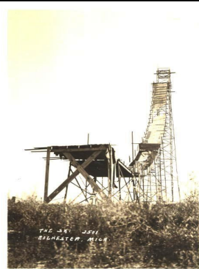
Ski Jump under construction.