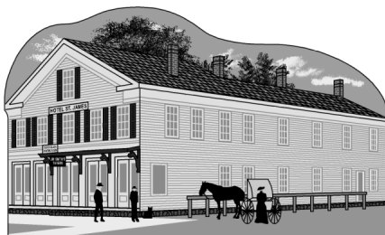
St. James Hotel