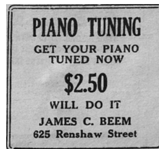
Vintage Post Card and ad contributed by a private owner;