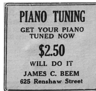
Vintage Post Card and ad contributed by a private owner;