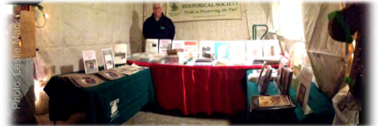
RAHS booth at the 2014 Downtown Kris Kringle Market

We also plan to have a RAHS booth at the Downtown Rochester Kris Kringle Market on Dec. 4 and 5. We'll