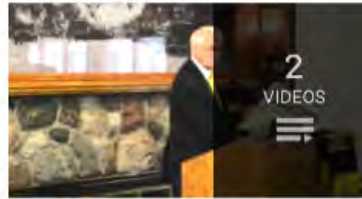
RAHS Brown Bag Lunch Programs (Rochester...) Updated 4 days ago