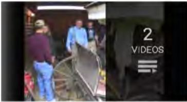
RAHS Projects Updated 4 days ago