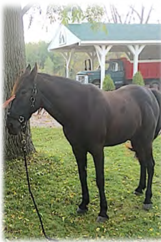
Bailey Boy at the Flying D Farm in Oakland Township