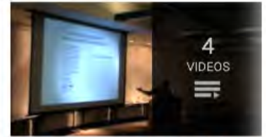
RAHS Evening Programs (Library Multipurpose Room)

Click here to visit our YouTube Channel, or copy the following link and paste into your browser window: https://www.youtube.com/channel/UCR5hvF6MsidqRn1e5e95A