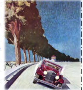
1933 PPG Night Test