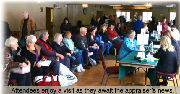
Attendees enjoy a visit as they await the appraiser's news.