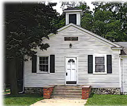
Stoney Creek School For more information, visit: http://oaklandregionalhistoricsites.org/property/1501352007