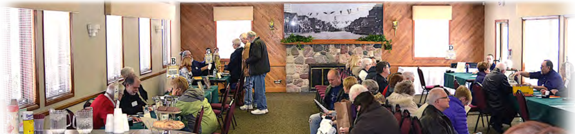
RAHS provides coffee and snacks for attendees while appraisers share their expertise.