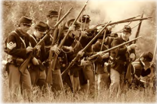
Tenth Michigan Infantry