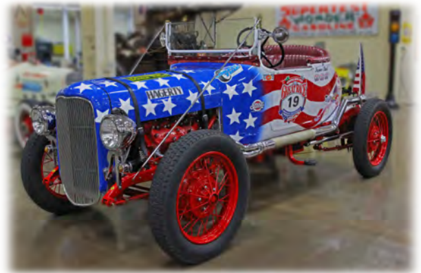
1932 Ford Speedster

We look forward to a good turnout for this event, because we hope to organize more of these trips in the future.