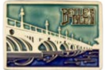
Pewabic tile

RAHS has arranged bus transportation departing promptly at 9:00 a.m. from the Kmart parking lot (southwest corner of Rochester and Avon Roads). We'll visit three venues on Belle Isle: the Aquarium, the Anna Scripps Whitcomb Conservatory and the Dossin Great Lakes Museum. We'll then be transported to Sindbad's restaurant for lunch,* after which we'll travel to Pewabic Pottery for a short tour and a chance to shop! Finally, we'll board our bus and arrive back in Rochester around 3:00 p.m.